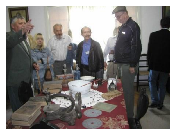
Visit to the heritage museum Jimbolia