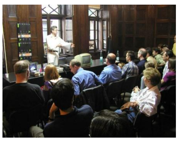
Audio-visual sci-fi quiz