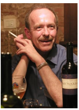
Writer's fuel: 'Red Paradox' wine