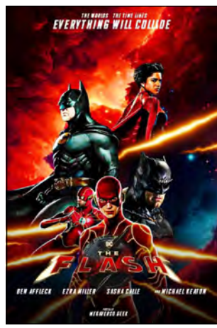
Above and below: Some of the many films the group has been to in its first few years.