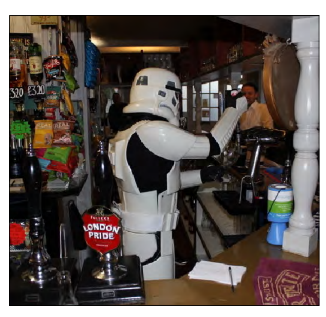
Meeting the 2nd Thursday of each month, Northumberland Heath SF is...